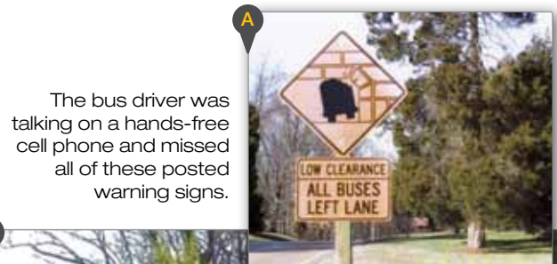
The bus driver was talking on a hands-free cell phone and missed all of these posted warning signs.